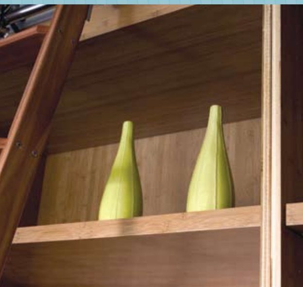
Library in the U.S. Green Building Council’s LEED® Platinum headquarters; fabricated using PureBond® veneer core hardwood plywood with bamboo veneers.

For more information on PureBond, or to specify it for your next project, call one of the regional numbers below or visit www.columbiaforestproducts.com .